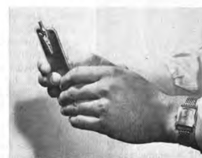
(7) Security Inspector